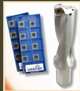
● DSP Cutter & Inserts